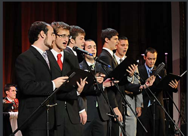
Cleveland based Slovenian mens chorus Mi Smo Mi