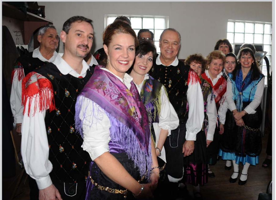
November 28, 2009 Backstage with the Singing Slovenes at Slovenian National Home 6417 St. Clair Ave. Cleveland, Ohio

our entourage of musicians and singers and faithful followers by motor coach as we left Duluth, MN on Wednesday evening and driving through the night, arriving at Sterle's Slovenian Country House at noon on Thanksgiving Day. It was a pleasure to see so many of the musicians who are a mainstay of the Cleveland scene. Upon our arrival at Sterle's, we