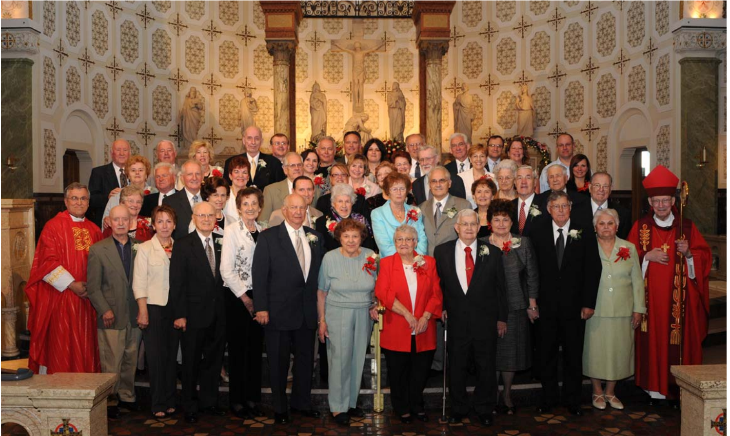
St. Vitus Church Cleveland, Ohio May 31, 2009 Photo gallery: http://www.cleslo.com/photos/2009-05-31.shtm

We want to congratulate the 23 married couples that came to St. Vitus Church today to thank the Lord for the many graces received through the sacrament of Holy Matrimony. Their constant faith in one another and the graces of the sacrament have brought them to this special day. We pray for the Lord's continued blessings upon them and their families.