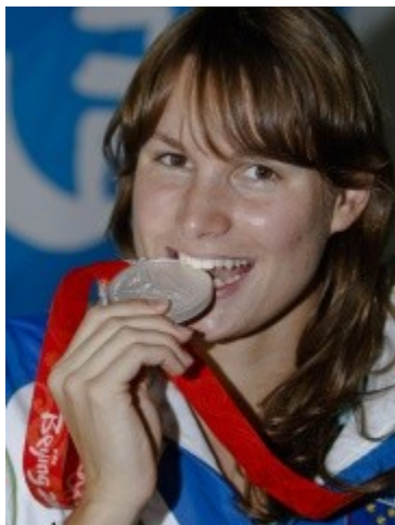
Sara Isakovič wins Olympic silver for Slovenia in the women's 200m freestyle.

Isakovič won the European title in the 200-meter freestyle earlier this year. On Wednesday, she was the silver medalist in the event. She finished only 0.15 of a second behind the world record set by Italian Federica Pellegrini in the race. Isakovič touched the wall in 1:54.97.