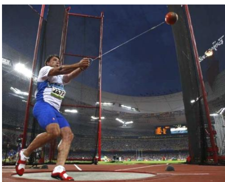
Primož Kozmus won the gold medal.

Slovenia's Primož Kozmus picked up Slovenia's first Olympic gold medal in the men's track and field competition this past Sunday. Kozmus won the hammer final in Beijing after throwing a season's best of 82.02m to claim the gold. Kozmus jumped into the lead with his second round throw of 82.02m and consolidated his lead with four throws just over the 80m mark. Vadim Devyatovskiy from Belarus took the silver with a throw of 81.61m, while his co-patriot Ivan Tsikhan took bronze with 81.51m.