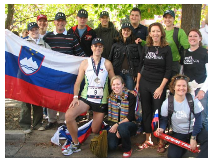
Fundraising Marathons- Ambassador Žbogar has raised a total of $71,418.00 USD, thus providing eight landmine survivors from Bosnia and Herzegovina with the rehabilitation treatment they need in Slovenia.