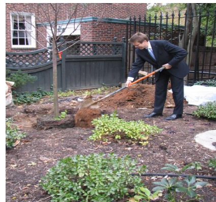
Planting the traditional Slovenian Linden tree in front of the new embassy building.