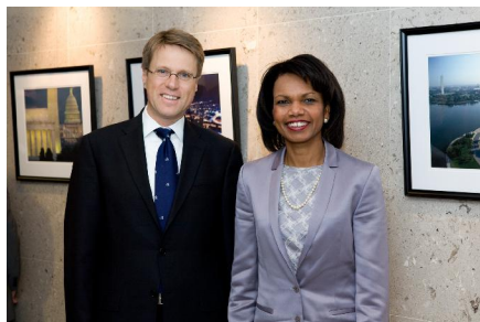
The Slovenian Ambassador welcomed numerous distinguished guests at the Embassy during the EU Presidency, including Secretary Rice and Secretary Gutierrez.