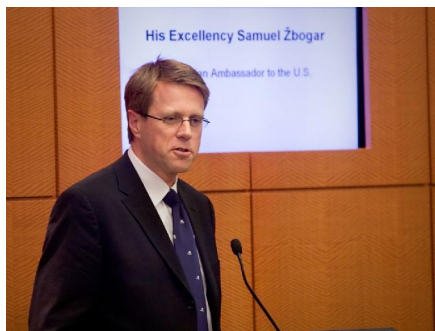
"The Slovenian ambassador is among the younger breed of diplomats who know that sometimes the best way to promote their causes is to get out of Washington and engage average Americans." Washington Times on April 2007